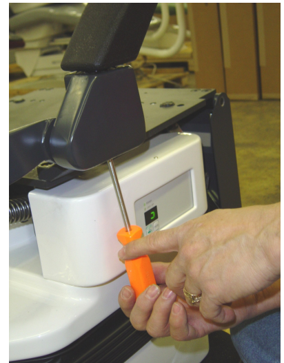
5. Tighten screw with a Phillips head screwdriver.