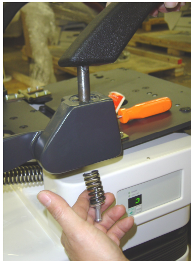
4. Insert armrest into the top of the armrest bracket. Insert washer and spring over screw, then insert into the bottom of the armrest bracket.