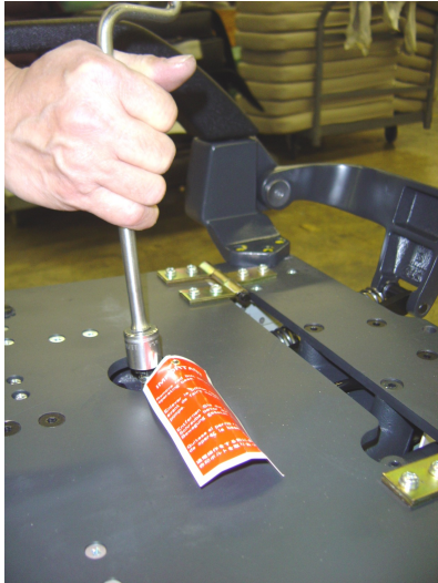
1. Remove tagged red shipping bolt with 11/16" socket wrench.